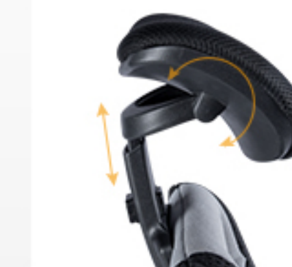
Angle & Height adjustable