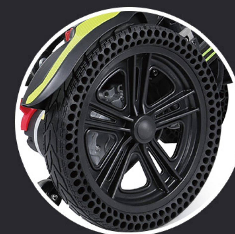
Suspension wheel Rubber material