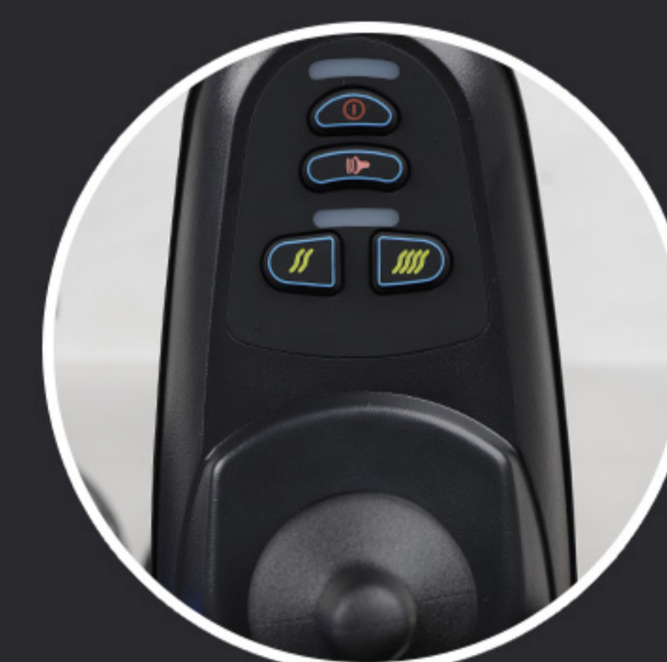
Intelligent controller Easy control