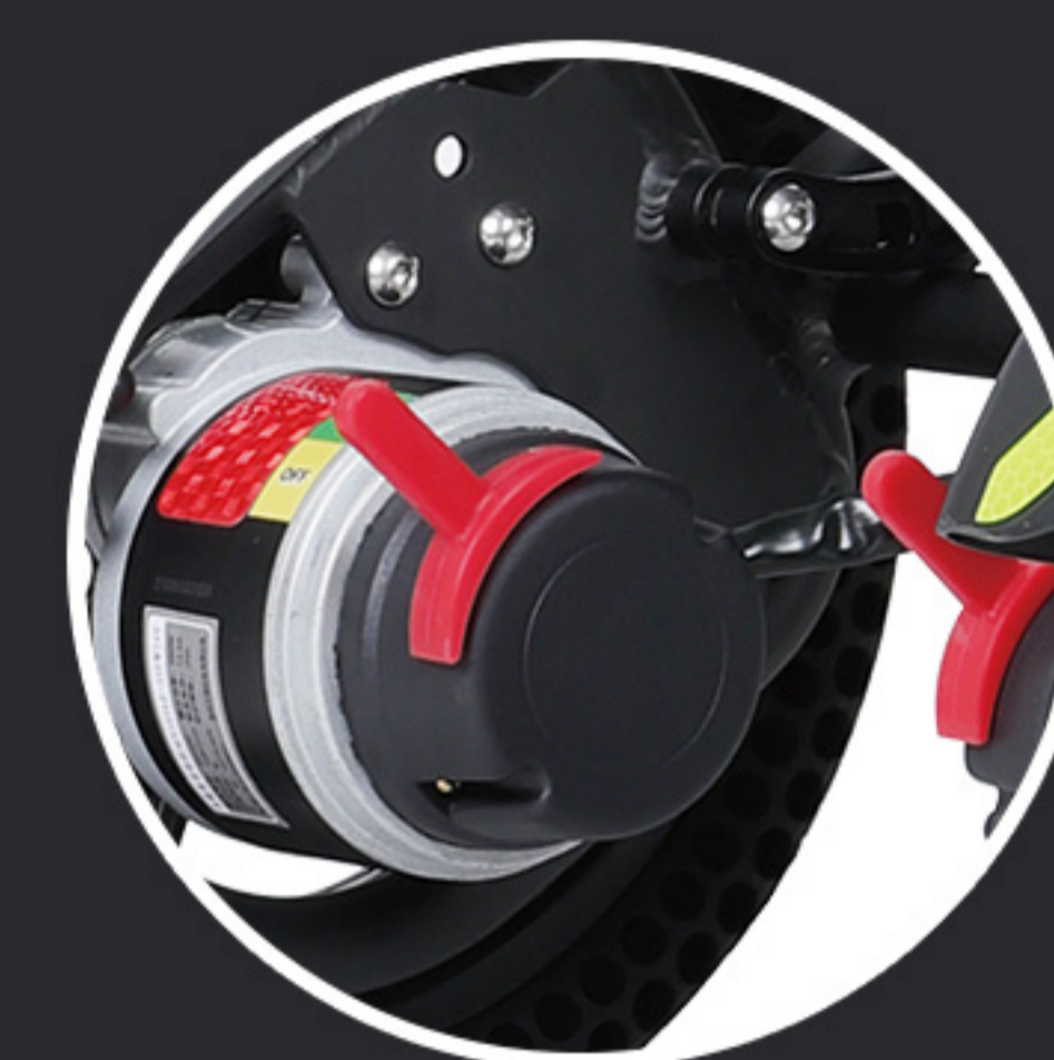
Powerful brushed motors 250W*2